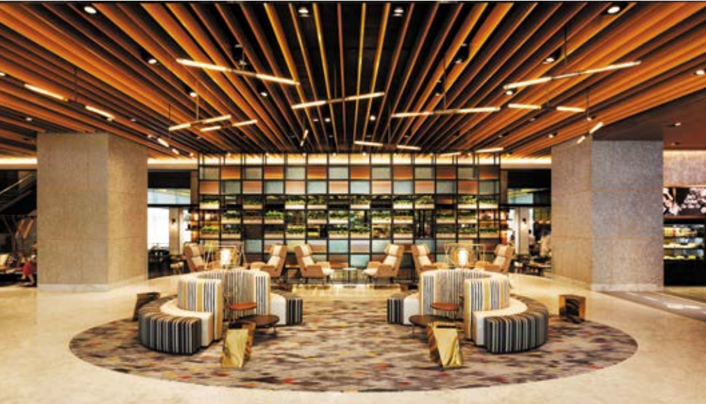
Clockwise from the top: Main Lobby, Hotel Jen Tanglin; Poolside at The Hilton Batang Ai; Travel by longboats at Batang Ai.