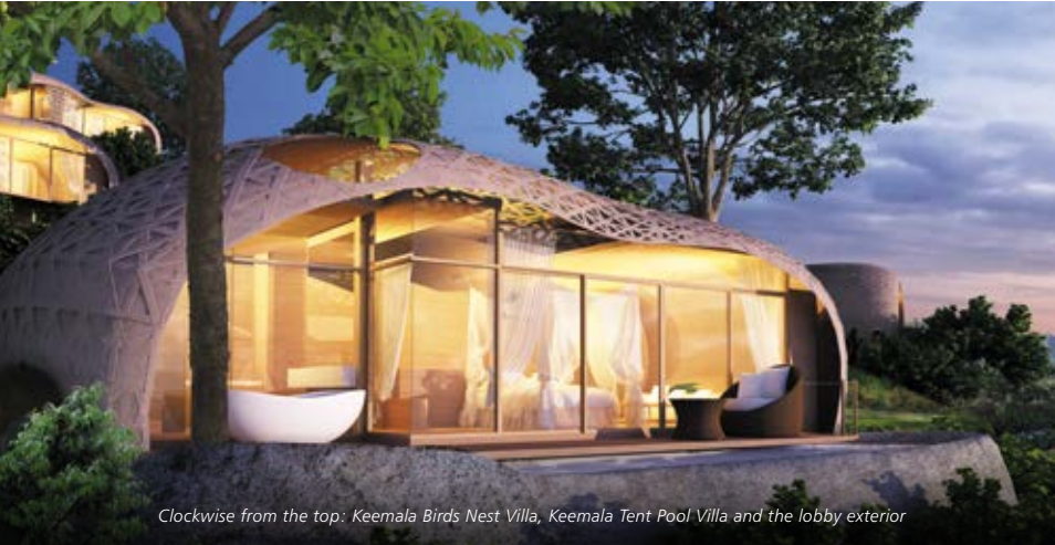
Clockwise from the top: Keemala Birds Nest Villa, Keemala Tent Pool Villa and the lobby exterior