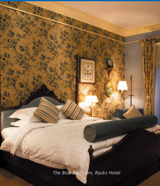
The Blue Bedroom, Rocks Hotel