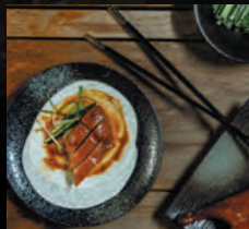
PEKING DUCK ROLL