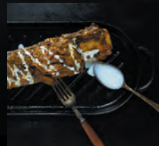
LONG RIB BEEF RENDANG