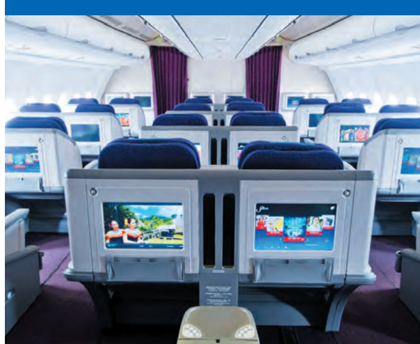
Clockwise from the top: Malaysia Airlines' new airbus takes flight; More legroom for Malaysia Airlines' Economy Class seating; Malaysia Airlines' Business Class layout.

“ Customer service is now paramount and there is a greater understanding of the market segmentation. We are able to segment the market and offer each one exactly what they want, when they fly be it value for money or, the most luxurious service possible. ”