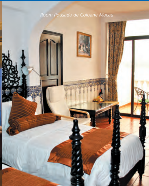
Room Pousada de Coloane Macau