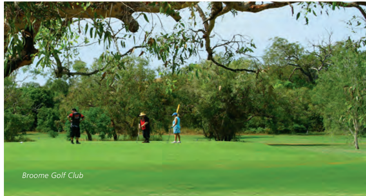
Broome Golf Club

Broome is the birthplace of the Australian pearl industry and its Japanese and Chinese cemeteries provide an insight to the region's history. The Broome Golf Club is the best place to watch the sunrise and sunset over the course located in the far northwest of Western Australia. Couch grass ensures the fairways are ranked as some of Australia's best. Over the past years, 14 new greens have been established and planted out with couch grass with the result being firm greens that play medium to fast. Experienced golfers claim that playing straight on the par 72, 5,926m-long course is the best strategy. www.broomegolfclub.com.au