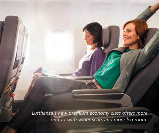
Lufthansa's new premium economy class offers more comfort with wider seats and more leg room.