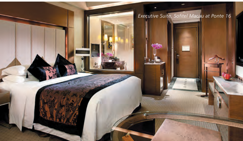
Executive Suite, Sofitel Macau at Ponte 16