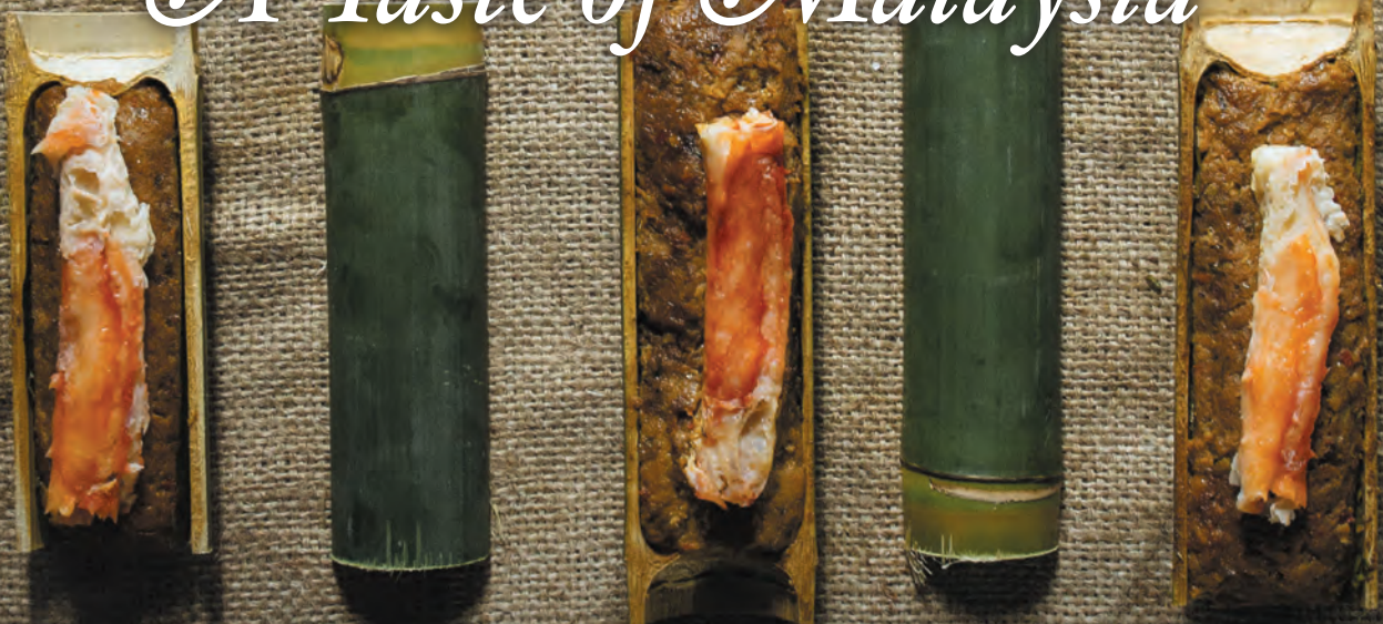
ALASKAN KING CRAB OTAK-OTAK