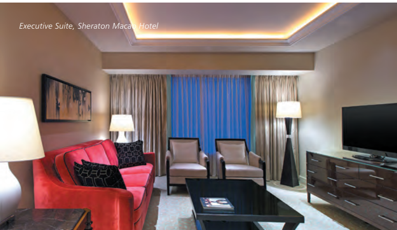
Executive Suite, Sheraton Macao Hotel