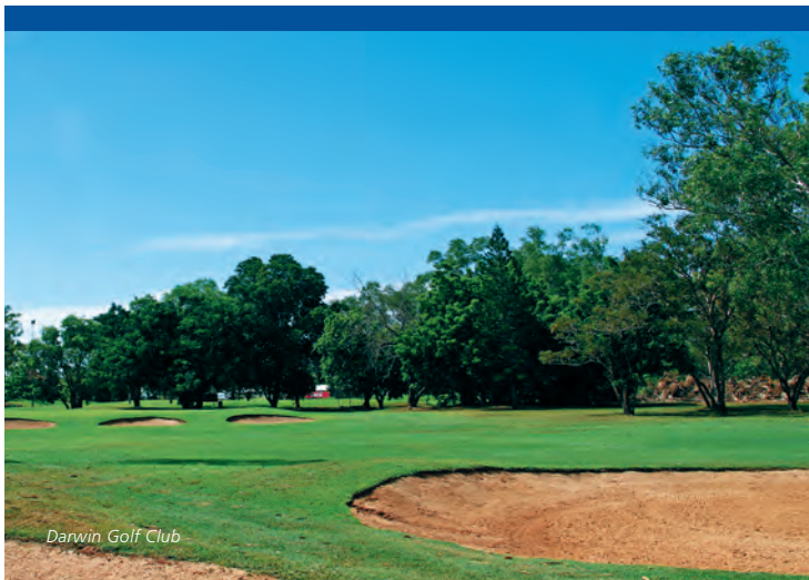
Darwin Golf Club