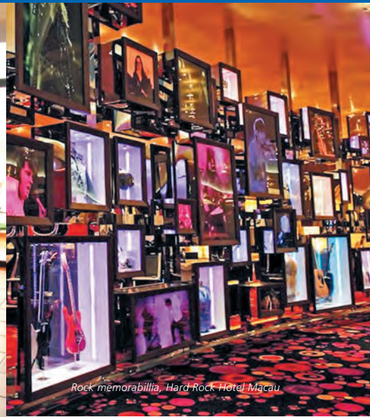
Rock memorabilia, Hard Rock Hotel Macau