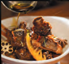
BRAISED SPICY VENISON RIBS

For dining reservations, please call (03) 2172 7272 or visit makan-kitchen.com