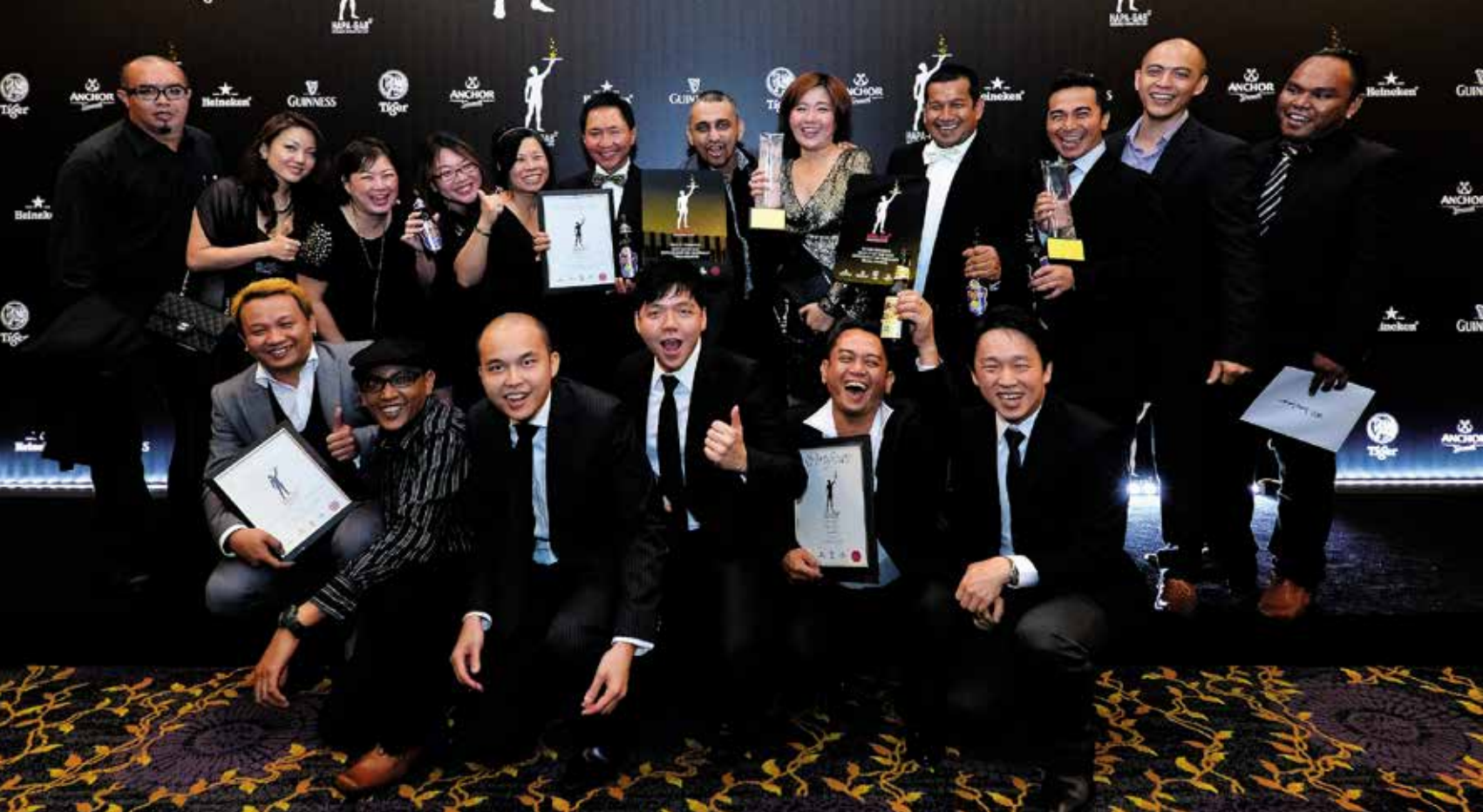
The Souled Out Group posing with their HAPA-GAB Excellence Awards 2013-2014 trophies.