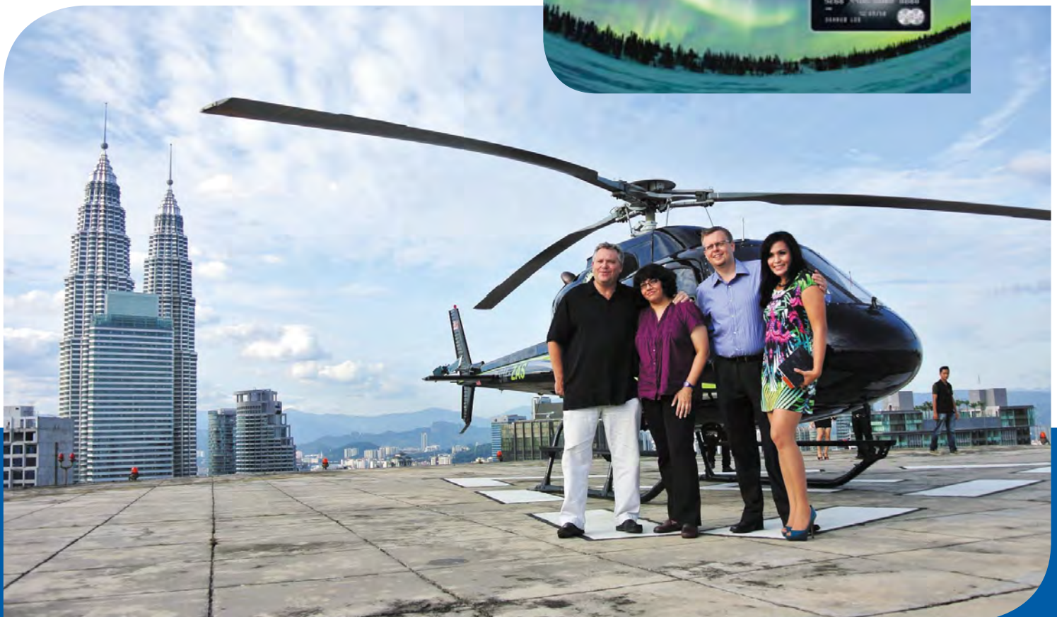
Citi Prestige offers card members exclusive privileges and access to a world of unforgettable experiences.