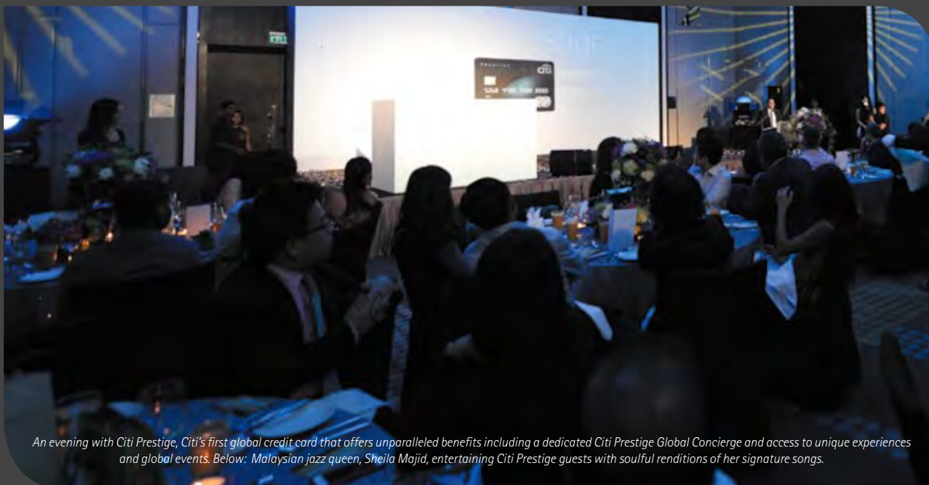
An evening with Citi Prestige, Citi's first global credit card that offers unparalleled benefits including a dedicated Citi Prestige Global Concierge and access to unique experiences and global events. Below: Malaysian jazz queen, Sheila Majid, entertaining Citi Prestige guests with soulful renditions of her signature songs.

who swipe their card a minimum of three times while travelling abroad can redeem their free ride home from a Citibank Priority Booth at the Airport Limo (M) Sdn Bhd counter, where a dedicated staff ushers them straight to a waiting limo."