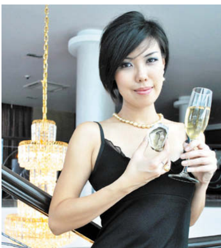
A Champagne & Oyster Soiree

The bountiful buffet spread at Latest Recipe keep patrons coming back yearly. Consistent cuisine quality and decorations resembling a bustling night bazaar allows one to enjoy hearty traditional Malay delights and International fare in true muhibbah spirit. ha