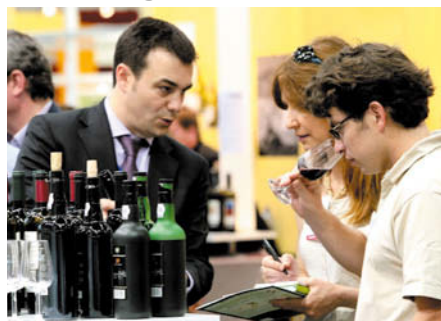
Wine sampling at Vinexpo 2011 in Bordeaux

of their favourite season. Spring, Summer, Autumn and Winter was therefore the recurrent theme of this outdoor exhibition laid out over the entire Vinexpo site.