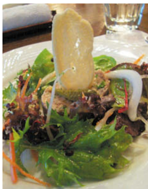
Right: Chef Motomatsu in action Above: Kagoshima Kurobuta Rilette Salad with pickles and baguette

Matsu Contemporary Japanese Cuisine 1 Nanson Road #02-02A Gallery Hotel Singapore 238909 Tel: +65 6836 1613