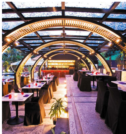
Seb's Bistro caters to various kinds of event settings