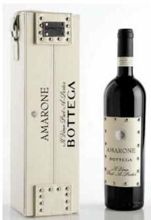
The wine in its sleek carry case