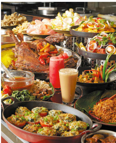
Repast to warm the heart at Latest Recipe