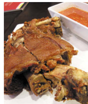
Left: House-brewed Weizen, Dunkel and Lager to accompany a spicy tom yum soup Above: Tawandang's best selling pork knuckles

Tawandang Microbrewery, Suntec Singapore 1 Raffles Boulevard, Suntec Convention Hall Unit 01-01A/B, Singapore 039593 Tel: +65 6243 2291