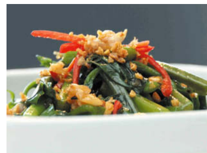
Left: Red shrimp curry Above: Stir-fried fern tips

My Elephant C-G-4 Happy Mansion Jalan 17/13 Section 17 Petaling Jaya, Malaysia Tel: +6010 2201283