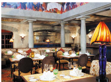
Villa Danieli is a cozy trattoria-style Italian restaurant