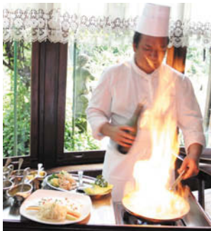
Right: Garden terrace at Oasis Above: Oasis offers the widest range of a la table flambe in Indonesia