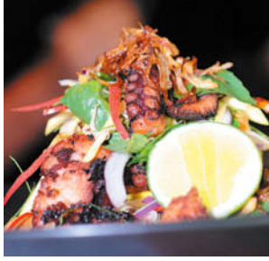
Right: The classy interiors of Sarong Above: Twice cooked octopus with green mango hot and sour salad