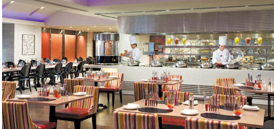
The award-winning Carousel restaurant at Royal Plaza on Scotts

During the seminar, Willman touched on some very insightful topics such as the different types of cheeses, how to present and serve them, cheese pairing with food and wine, and what sets Australian cheese apart from the rest of the world. Part of the seminar programme was a delightful cheese tasting session where attendees were privileged to sample a vast range of Australian cheese. At the end of the seminar, attendees adjourned to a networking dinner where they had the opportunity to meet and greet Neil Willman, while building their networks with importers and distributors of Australian cheese. ha