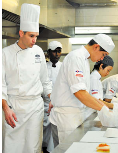
Mandarin Oriental's Executive Chef closely guides his team as they prepare the main course