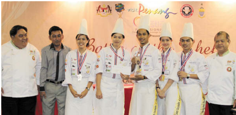
From the top: The judges carrying out their duties of testing and scoring; Award recipients posing for a group photo; Most Outstanding Ghee Hiang Asian Cuisine Award presented to Thailand Culinary Academy

Many new records were set during this three-day battle among culinary contenders from across the world. With over 800 participants competing in 44 classes of events and more than 1000 entries received, the organizers pronounced this year's event as the biggest turnout to date resulting in a 37.5 percent increase compared to last year's participation. Among the participating countries were Russia, the United States of America, Taiwan, South Korea, Thailand, the Philippines, Singapore, China and several states from Malaysia.