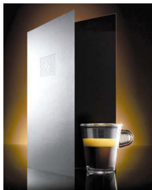
A depiction of Nespresso's charming cup of espresso

The contents of the bottle is an absolutely excellent wine – a special vintage of Amarone, which originates from Corvina, Rondinella and Molinara grapes, harvested in the most elevated zone of Valpolicella, at about 600 meters in height. In this way the fruits reach full maturation, after the half of October. ha