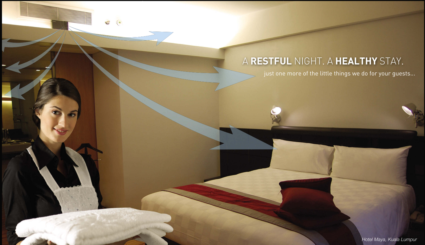
Hotel Maya, Kuala Lumpur

The MedKlinn PRO Series of products is specifically designed to eliminate persistent stale air and bad odour . Using minimal power and requiring minimal maintenance, it continuously cleans the air and eliminates the source of the problem – by killing mould and bacteria, removing odour and neutralizing allergens thriving on the carpets, curtains, cushions and furnishings, leaving the air clean and fresh. Give your guests another reason to come back - MedKlinned air!