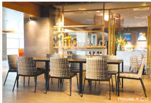
House + Co