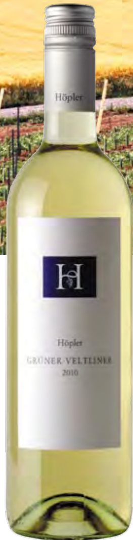
Above (from the top): The crops and vines of Burgenland 8091; Grüner Veltliner Höppler

W ith total annual production of a little over 2.2 million hectolitres, Austria produces just 1.12 per cent of the world's total production. It lags well behind the three main wine producing nations of France, Italy and Spain but also behind wine minnows such as Russia, Romania, China, Moldova, Greece, Hungary and Brazil. But this boutique star performer has successfully focussed on quality to capture the attention and imagination of the world's leading sommeliers and connoisseurs.