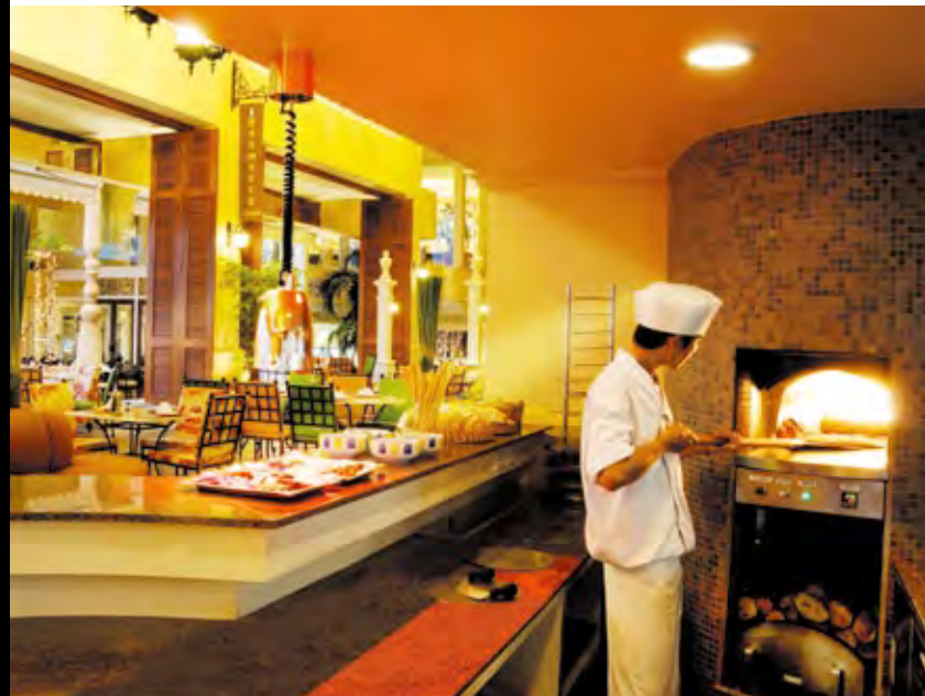
Wood-fired pizzas are a hot favourite at San Marco

Menu highlights include an eight piece sushi dinner featuring delicate slices of fresh tuna, eel, snapper, salmon and other tasty specialties. Extensive selections of sashimi and tempura items are also available. ha