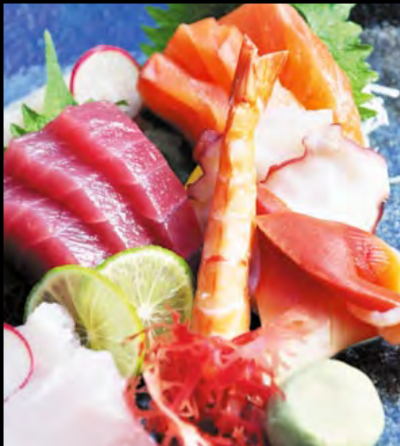
A selection of Setyo's sashimi

Left: The Amber Palace at Palace Hotel Tokyo