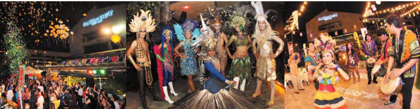
Above: Parties come alive at SOULed Out and WIP.